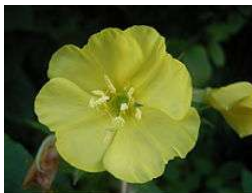
Evening primrose flower