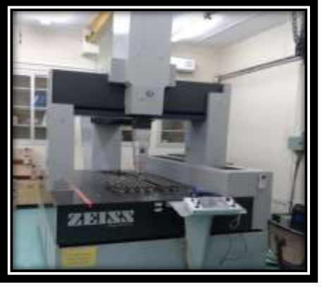
Fig 6. Co – ordinate measuring machine

The mean value of the readings were obtained and subjected to statistical analysis (Table 1) Student t-test was performed. Statistical significance