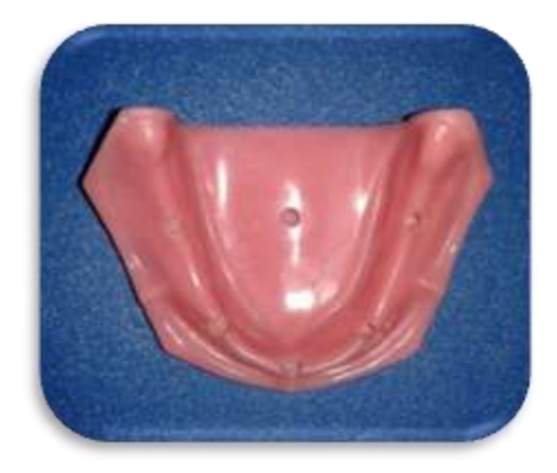
Fig 1. Acrylic resin reference cast consisting of five parallel holes 12 mm in length & 4.5 mm in diameter