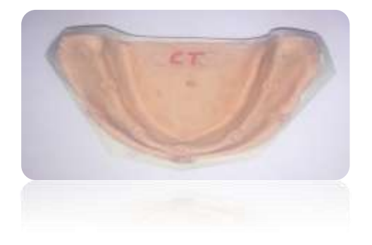
Fig 7. Casts obtained after closed tray impression technique

Each implant transfer procedure included making the impression, pouring the cast, removing the impression copings, and sterilizing them. The procedure was done in this way 12 times consequently, each impression coping was sterilized and used 12 times to produce definitive casts. One operator made all impressions and prepared all 24casts.