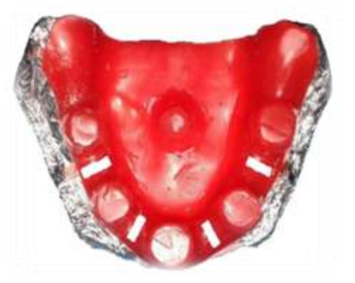
Fig 3. Fabrication of spacer

Sixty minutes after the impression procedure, the impressions were boxed. Die stone -type IV was manipulated according to the manufacturer's instructions and poured under constant vibration onto the impressions. Sixty minutes later the casts were retrieved from the impressions. Casts obtained from closed tray impression technique (Fig 8) and open tray impression technique. Co-ordinate measuring machine was used in this study. A wide, straight CMM probe recorded the distance between