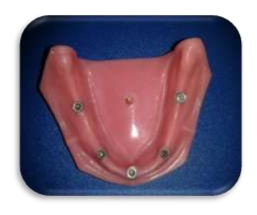
Fig 2. Five 11 × 4.3-mm diameter dummy implants were fixed into the holes with auto polymerizing acrylic

Syringe loaded light body vinyl polysiloxane was placed around the implant analogues and impression copings and over the putty loaded custom tray. Two type of impression techniques were followed group