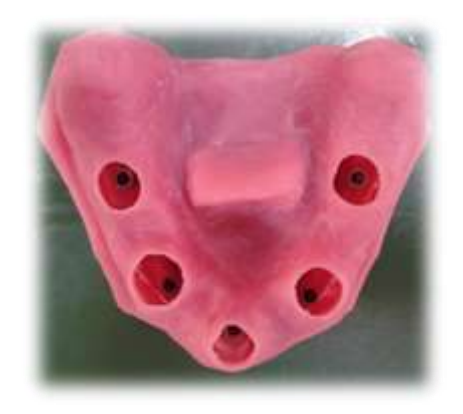
Fig 4. Fabrication of open tray