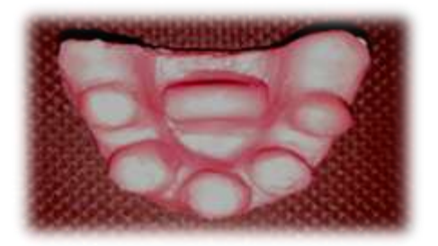
Fig:5 Fabrication of closed tray

the center of the implant orifice in each axis (x and y) and the perpendicularity of each implant compared with the horizontal crestal plane in the acrylic resin cast.